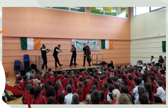
Graffiti Classics Concert November 19th in Holy Trinity NS..